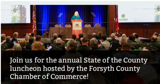
Join us for the annual State of the County luncheon hosted by the Forsyth County Chamber of Commerce!

Meeting: Sharon Springs Park Community Building February 12 • 4 - 7 p.m.