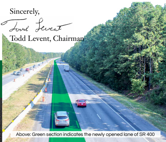
Above: Green section indicates the newly opened lane of SR 400