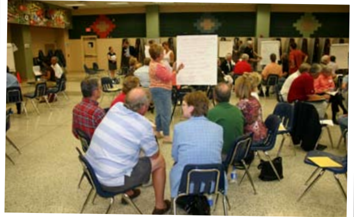
Above: Citizens gather at Otwell Middle School on September 19 for the first of the Envision 2030 meetings.

In an effort to promote water conservation, a new tiered water rate structure has been implemented by the Forsyth County Water and Sewer Department. While the sewer rates are not impacted by this change, the water rates have been changed from a standard flat rate to a tiered rate system dependent upon water usage. To determine your water bill total under the new rates visit www.forsythco.com/ratecalculator .