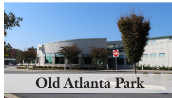
Old Atlanta Park

Upcoming Holiday Closures: County government offices (including county offices, the animal shelter, three Senior Services locations and three recycling convenience centers) will be closed January 2, in observance of New Year's Day and January 16, in observance of Martin Luther King Jr. Day. The three recreation centers will be closed on January 1 and January 16 and will be open January 2.