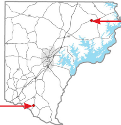
New Fire Station 8